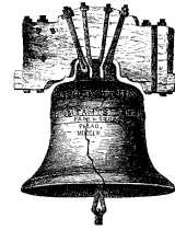
ON THE WEB

McWhiney Foundation Press is part of the Texas A&M University Press Consortium.